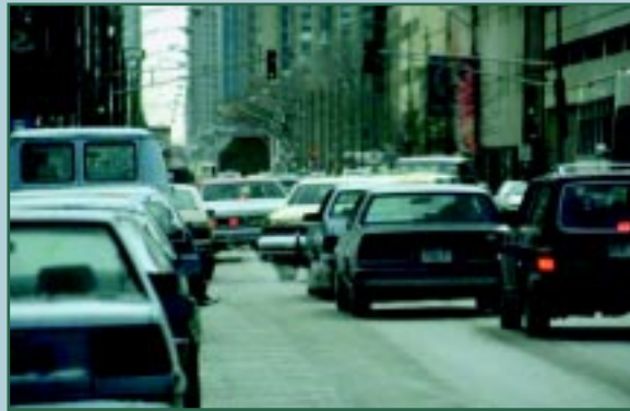
Don't let traffic happen to you. Support public transit and think outside the car.